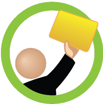
Free Online Resources