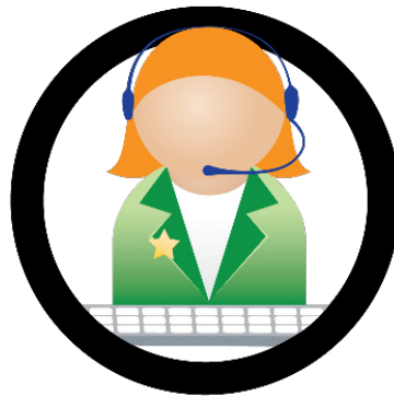
Live Online Help